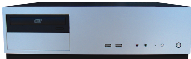
Savix with Optional DVD R/W Drive

Savix DVR's offer standalone, stable and easy to use surveillance recording with a rock solid Linux-based operating system at the core. A graphic user interface (GUI) provides users with a menu based setup for programming all features, which include configurable motion detection, individual channel video quality and camera capture rate (up to 480 images per second) with pre-alarm and post alarm recording available.