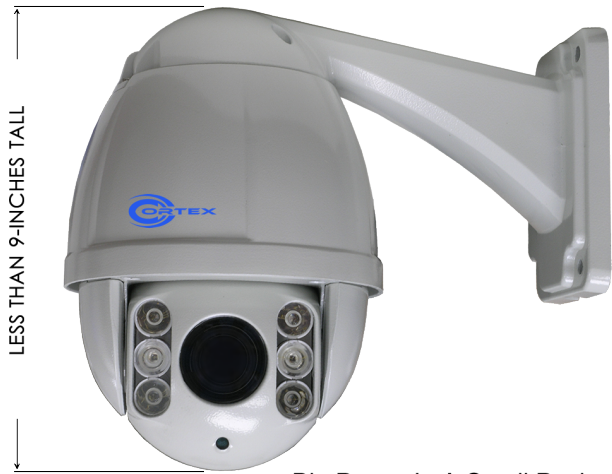
Big Power In A Small Package

LONG RANGE IR LEDS | SMALL SIZE | ANTI-VANDAL ANTI-TAMPER CONSTRUCTION | MULTIPLE TOURING & PRESETS