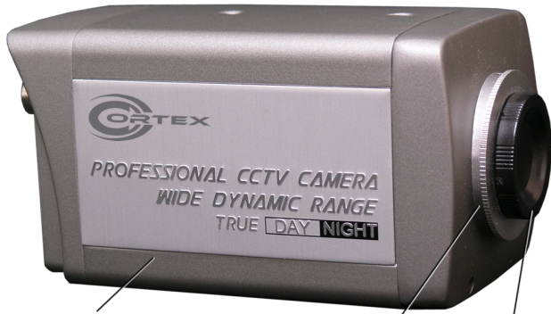
Aluminum Camera Housing CS-Lens Mount Protective Cover for CCD Video Sensor

Beginning with a CS-mount design that lets you to select a specific lens for your environment, the COR-552W includes features that set it apart from other day/night cameras. Motion detect operations, digital slow shutter (Sens-up), backlight compensation (BLC), and true wide dynamic range (non-digital WDR) can be configured using the camera's on-screen display (OSD). You can also configure white balance in a number of different modes. Sens-up settings allow this camera to pickup up images in light levels as low as 0.0002 LUX. With the OSD you can enhance image sharpness and color, reduce video noise and set up privacy masks.