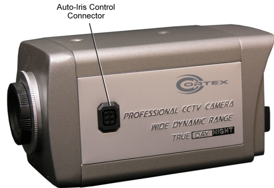
Auto-Iris Control Connector

With auto-iris control built into the camera a wider range of lenses become available. Any of our lenses shown above are perfect matches for this camera, as well as others. Contact a sales representative for a full list of compatible auto-iris CS-mount lenses.