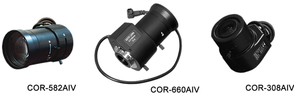
COR-582AIV COR-660AIV COR-308AIV

Attach bare wire leads (12VDC) to the POWER connector terminal block (note polarity). Attach a monitor to perform setup operations, and then you can access the OSD menu by using the five menu control buttons on the back of the camera. The OSD appears as an overlay on the attached monitor. Navigate the menu structure with the left/right and up/down buttons and use the center button (SET) to select an option.