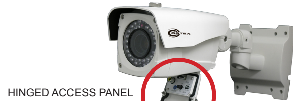
HINGED ACCESS PANEL