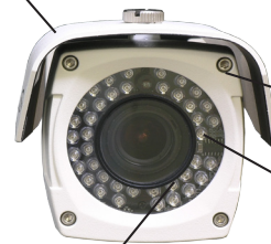
INTEGRATED LENS SEPARATOR ELIMINATES IR GLARE/HAZE